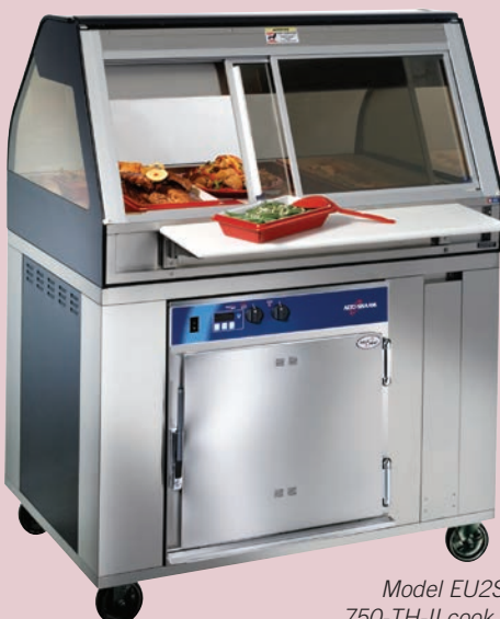
Model EU2SYS-48 back view shown with 750-TH-II cook & hold oven and optional casters