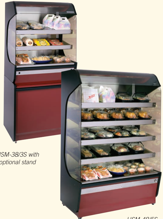
HSM-38/3S with optional stand

Dimensions 75-5/8" x 48-1/4" x 27-1/4" H x W x D (1919mm x 1226mm x 692mm)