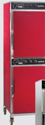
1000-SK-I shown with optional burgundy exterior †